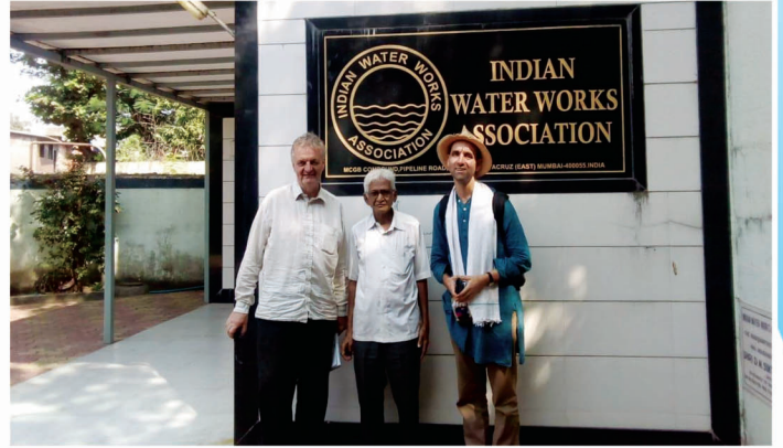
Denmark team December-19 th