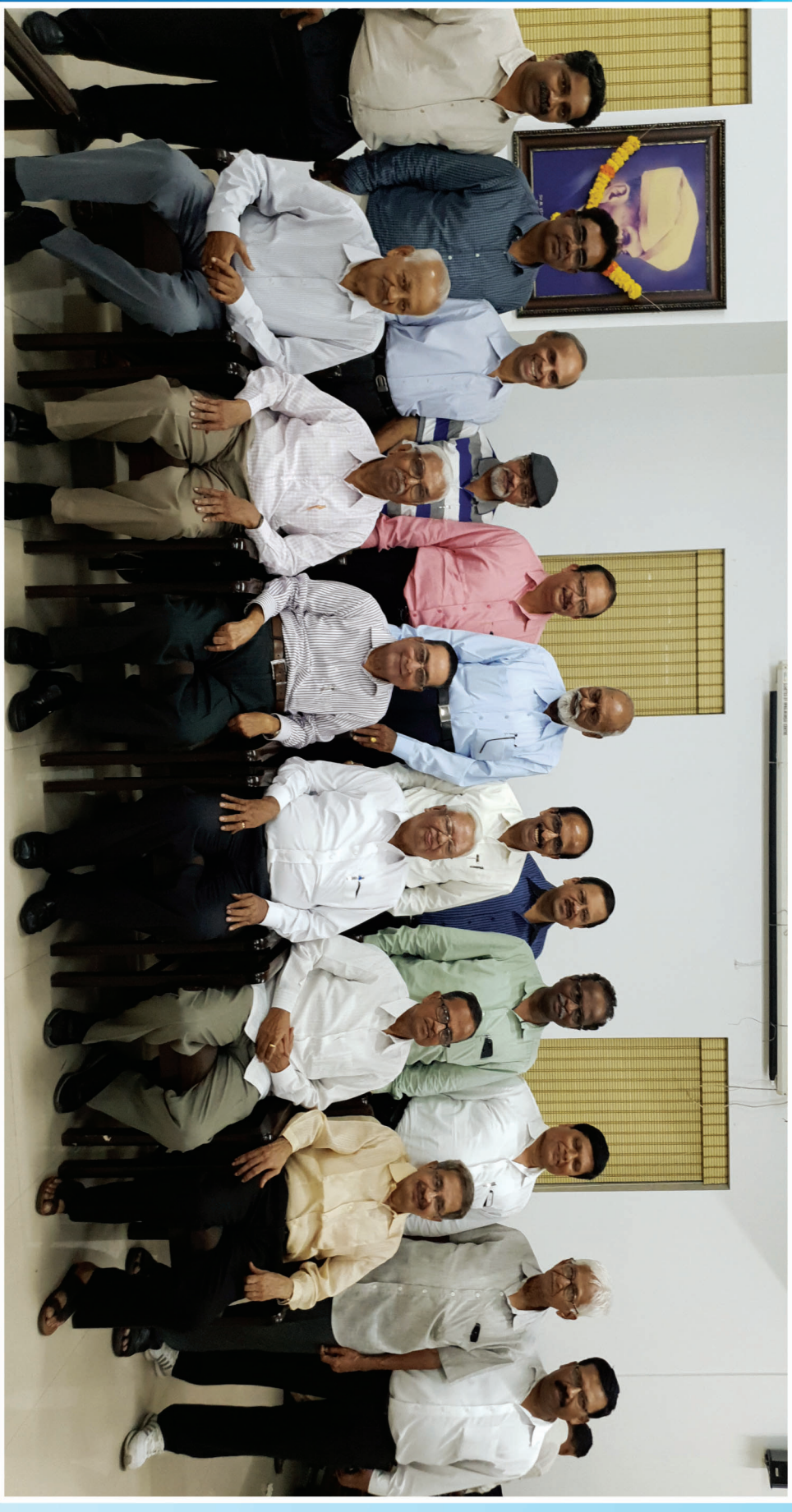
Felicitation of Veteran Members on September-27 th