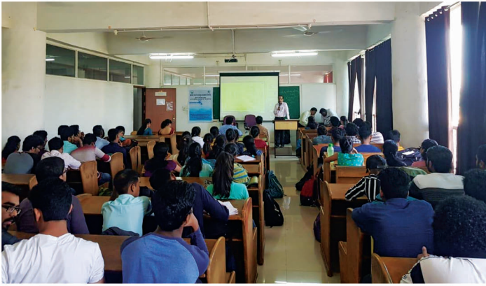
Youth Forum : Chapter Datta Meghe College Seminar on 'Advance Water Treatment' and Exhibition on Env Engg. on October-7 th