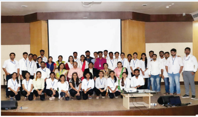
Youth Forum : Chapter Saraswati College Seminar on 'Water Treatment' on March-11 th