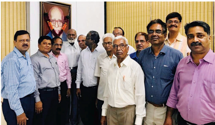
IWWA Foundation Day