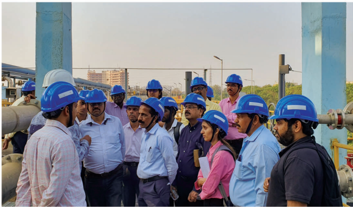
Technical Visit to New STP at RCF, Mumbai on February-8 th