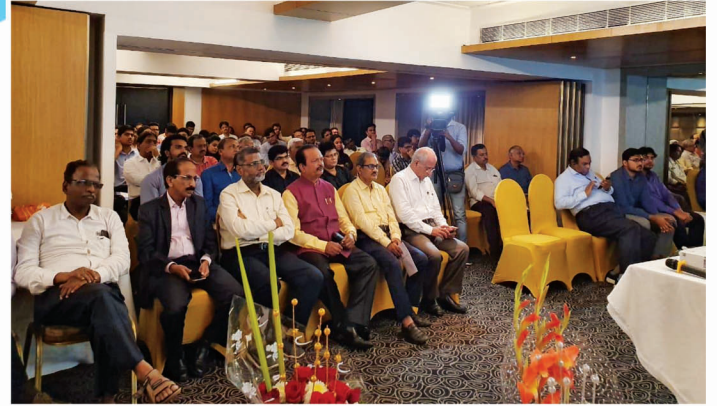
Engineers Day-2019 Lectures in Satkar Hotel, Thane