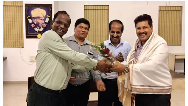
Felicitation of Award Winners on January-31 st