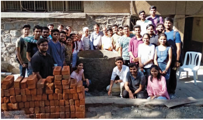
Youth Forum : Chapter Datta Meghe College Workshop on 'Water Storage by Ferrocement Tank' on April-2 nd