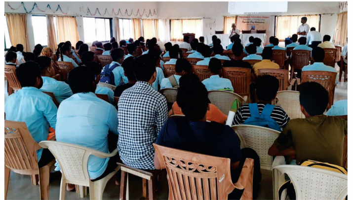
Co-organised Lecture Event with Jalwardhini Pratishthan at Govt. Polytechnic, Daman on September-16 th